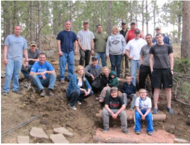
Ellsworth 34 th AMU Airmen And SD School of Mines Veterans Club